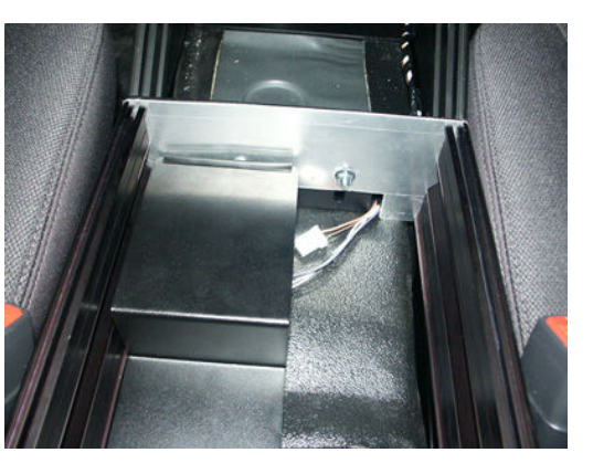
Attach YAW sensor cover panel (#5) to vehicle using front driver side hardware from rear floor filler panel (#6)